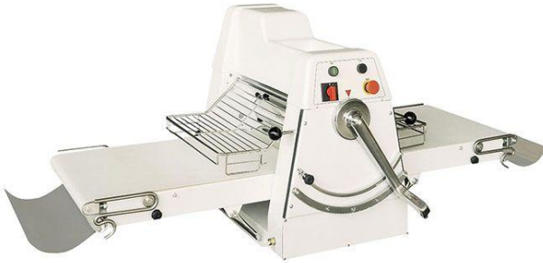
TABLE TOP SHEETER NO. SFB500